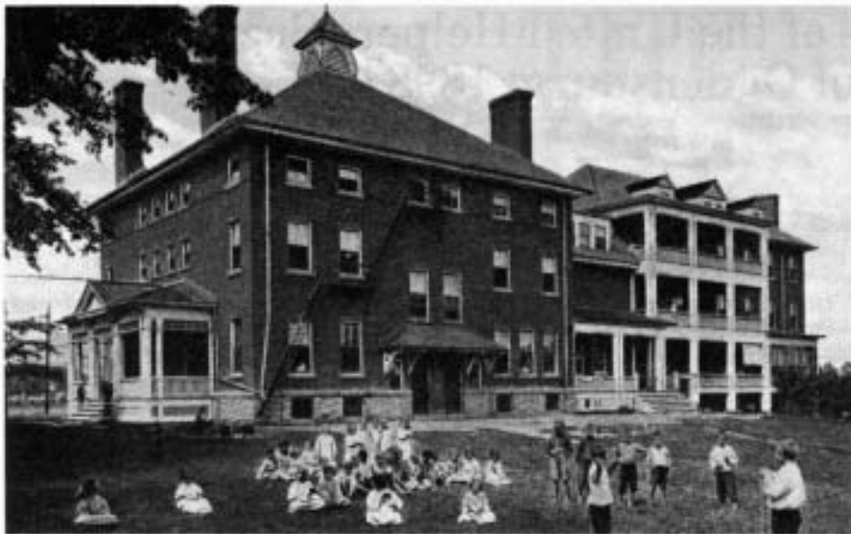
1910 postcard of the United Helpers Orphans' Home with annex.

dren's Home in Watertown had been founded in 1896 by the Sisters of St. Joseph.