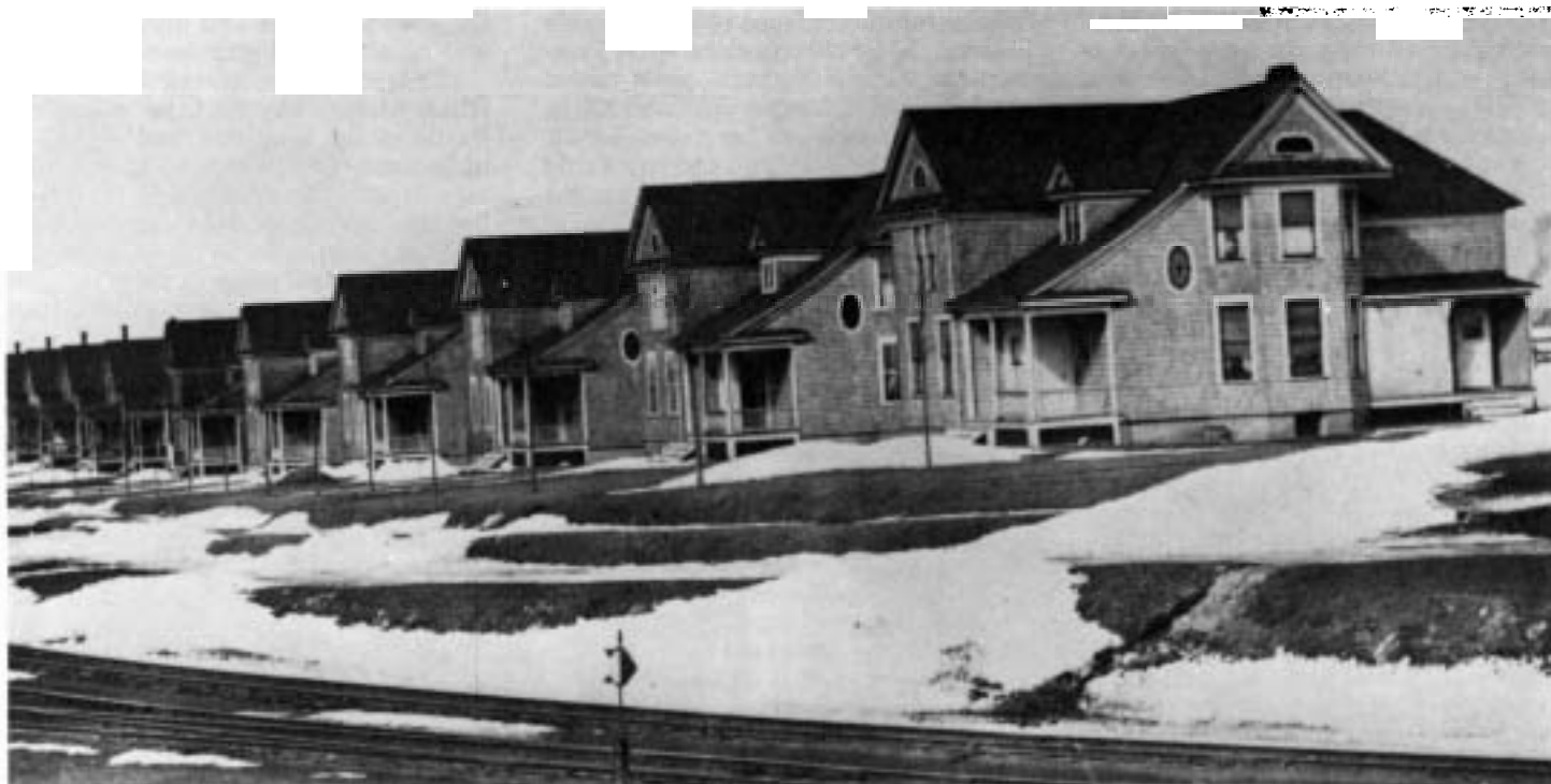
Remington Avenue, Norfolk. These houses were built by the St. Regis Paper Mill for their workers, circa 1915.