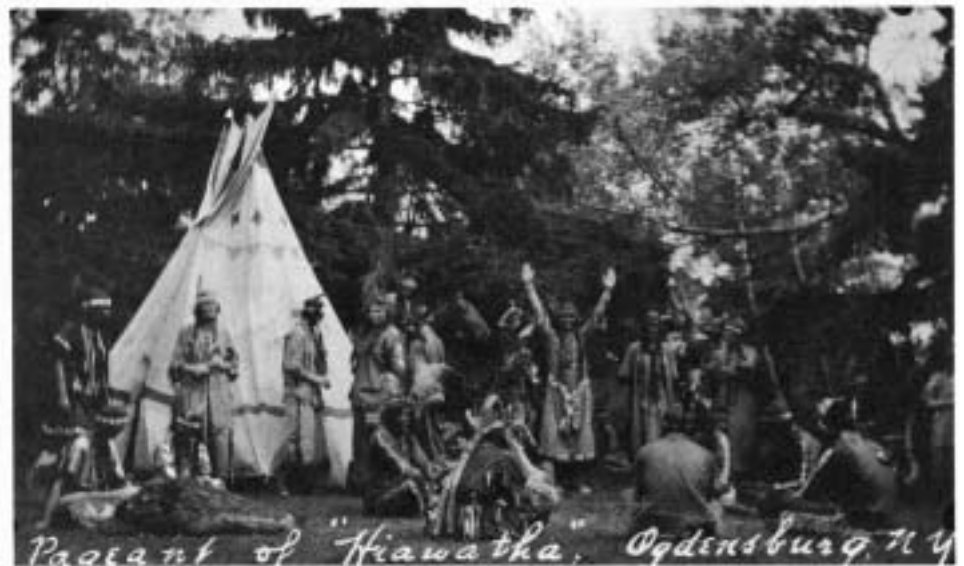
Photograph of the pageant of "Hiawatha."