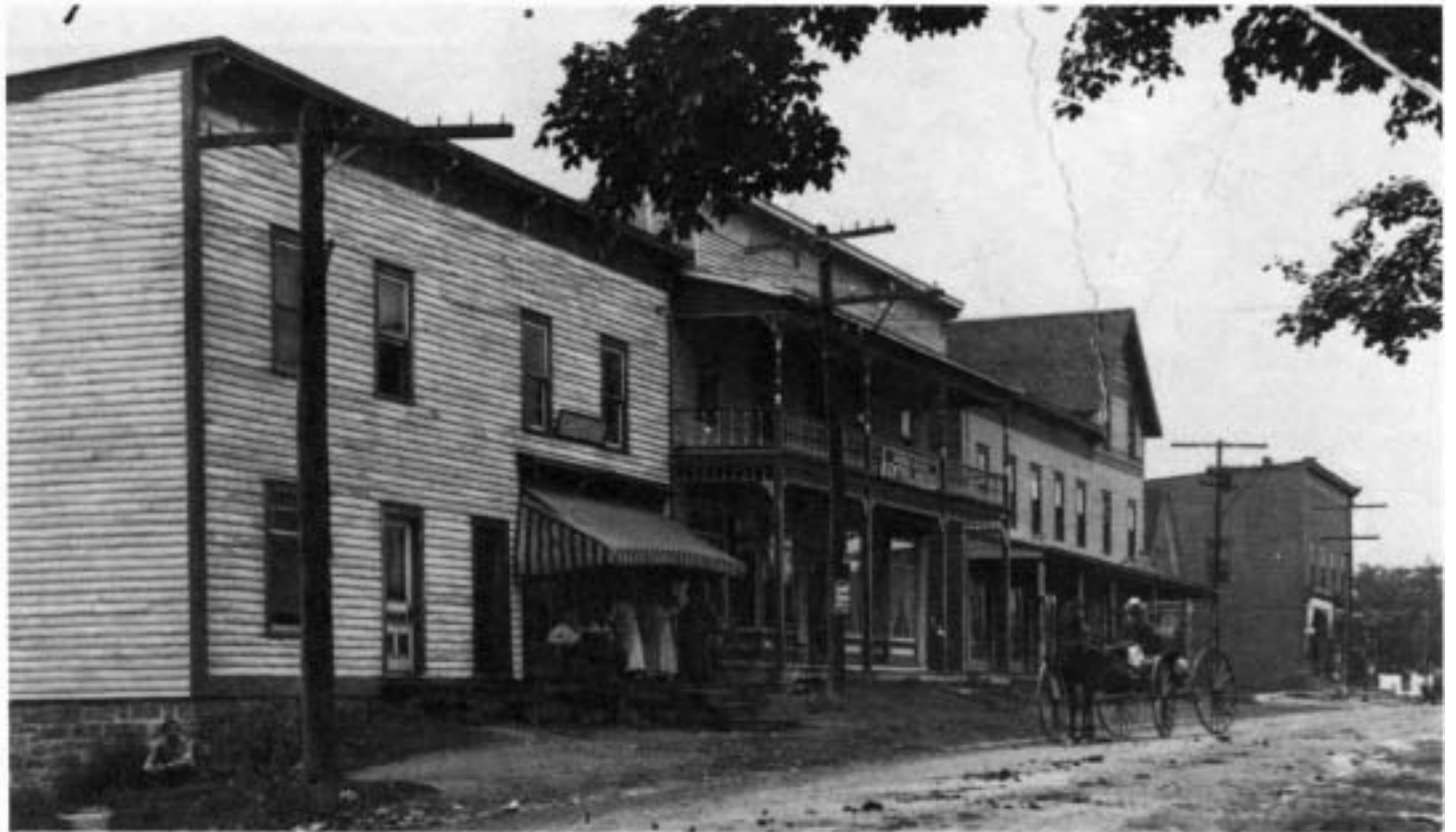
Main Street, Norfolk, before the 1915 fire.

five dollars a month. It took about a week's wages to pay for the rent.