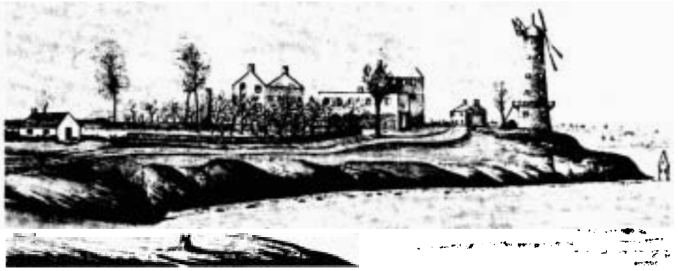
H.F. Ainsley's April 1839 sketch of the Prescott Windmill and surrounding buildings.

A bit of background is in order. In the fall of 1837 rebellions had broken out in the provinces of Lower and Upper Canada, as Quebec and Ontario were then known. These were local rebellions and, although they called for independence, they were rebellions more against entrenched local elites than against the British crown per se. The rebellions failed (which is why we call them rebellions and our own a revolution). They failed partly from lack of organization and military skills but mostly because most Canadians, unhappy as they may have been with the oligarchic provincial governments, were simply not willing to shoot at British soldiers or contemplate separation from the mother country. So the