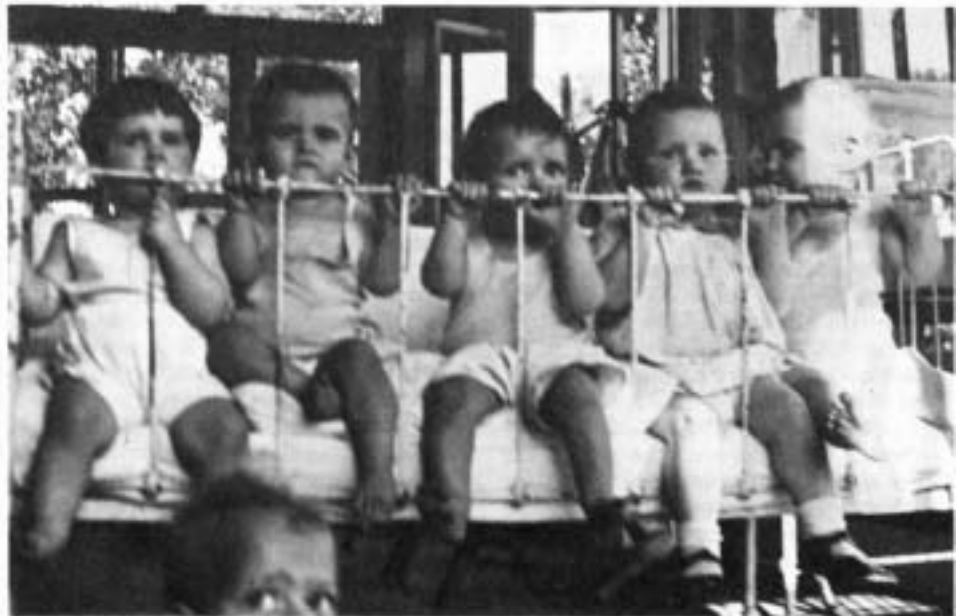
These photographs of babies, children, and elderly ladies who were residents in the United Helpers Home show that the Home was indeed a wholesome "family" environment. Although no dates are given, the elderly were first able to become residents in 1910.