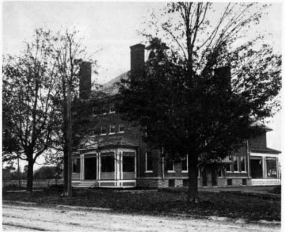
The first Children's Home of the Society of United Helpers as it looked in 1902.

Whereas, recent experiences of several of the ladies here present seem to us proof that a society for the aid and protection of friendless children is an immediate necessity.