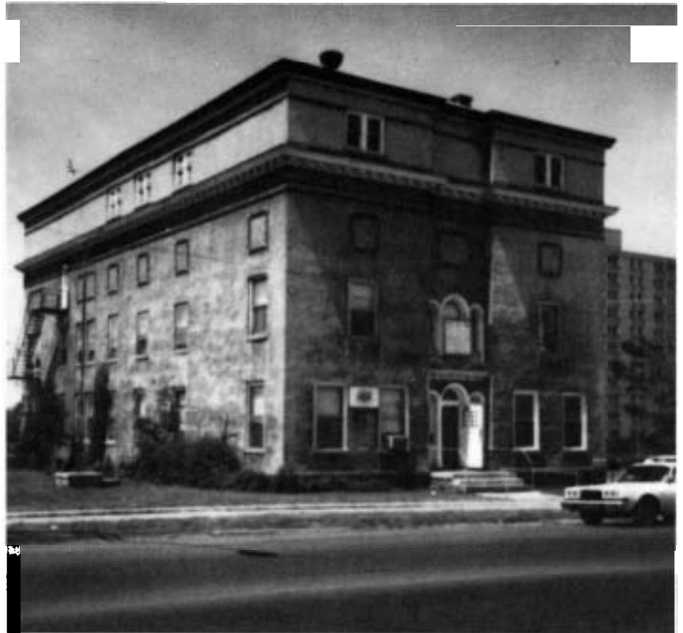
The Ogdensburg Masonic Temple today.

Thus was begun what is commemorated this year by Ogdensburg Lodge No. 128 - one hundred years of Masonic service. If we are to evaluate those years truly, we must look beyond the record of what was done in the Lodge, which is not too copious. Masons have ever busied themselves in the affairs of