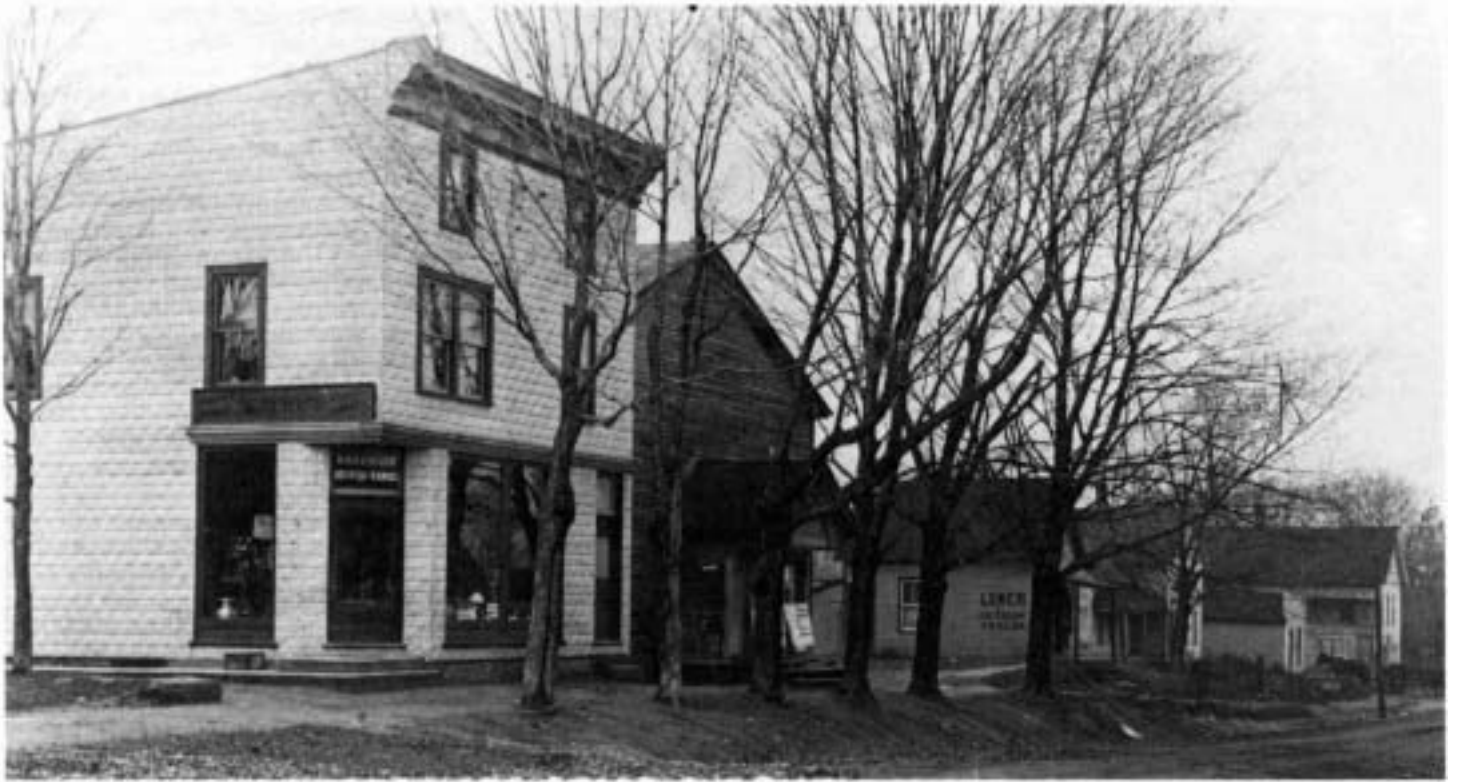
The new hardware store and picture show, West Main Street, Norfolk, circa 1910.