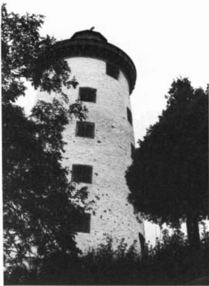
The windmill in its current state of restoration by Parks Canada.